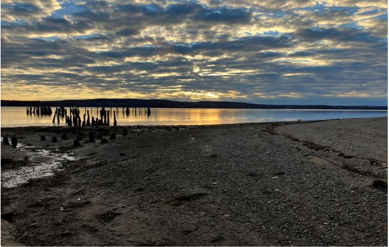
SANDY POINT BEACH AT SUNRISE